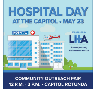
Hosted 68 Lawmakers at Legislative Luncheon & Hospital Day at the Capitol with Outreach Fair and Virtual Campaign