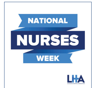
Celebrated National Hospital Week & National Nurses Week with Social Media Campaigns Featuring 121 Member Posts