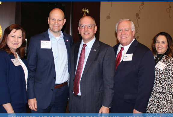
WINTER HEALTHCARE LEADERSHIP SYMPOSIUM

January 31 - February 1 Renaissance Baton Rouge Hotel