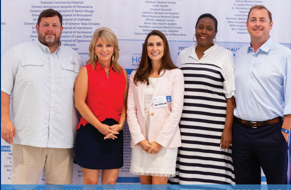
LHA ANNUAL MEETING & SUMMER CONFERENCE